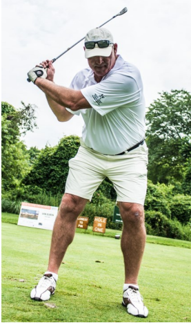
- Marty Lyons

"Imagine being on top of the world, and in a period of seven days you are forced to see the frailty, the unfairness and the wonder of life. I decided to use my name and my God-given talent to make a difference in the lives of terminally-ill children."